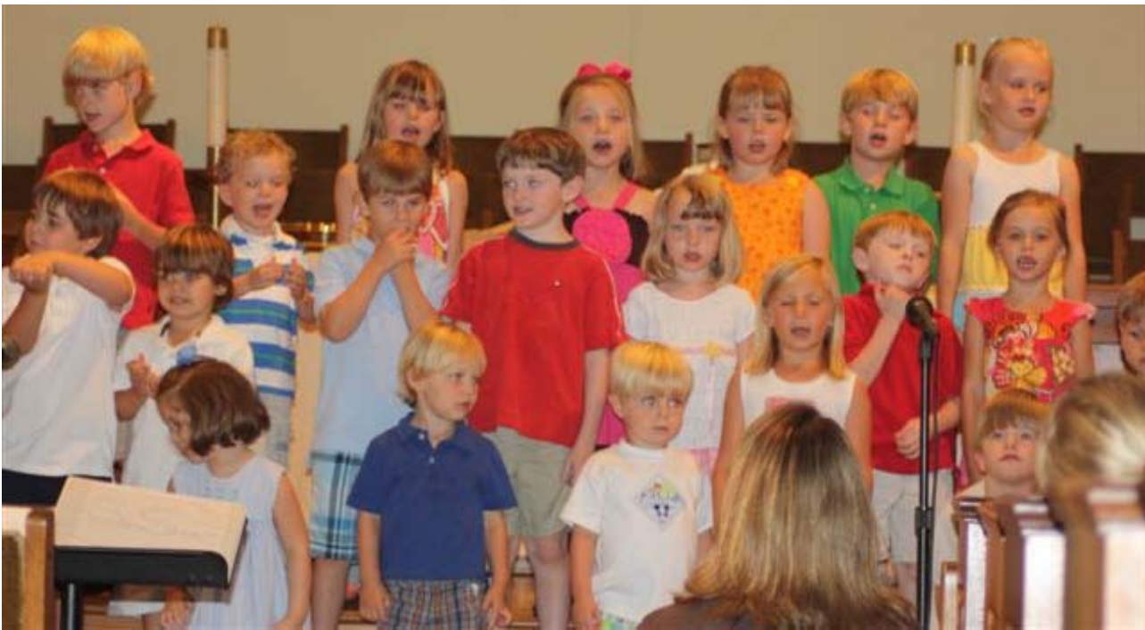
SonBeam Choir members perform at the Children's Spring Extravaganza on Wednesday, May 19, 2010.