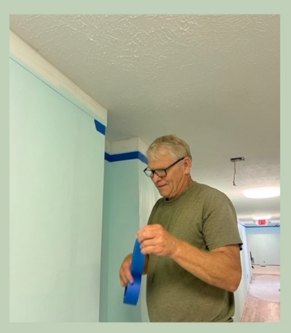
Methodist Children's Home Project