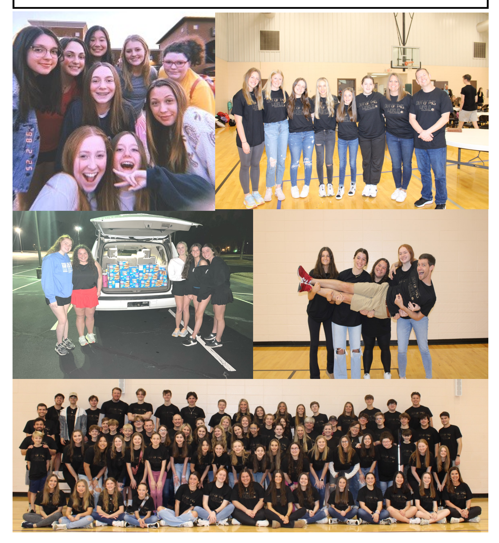
DNOW Student Retreat