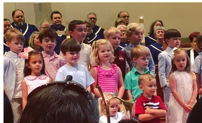
SonBeams Choir shared praise songs with their MUMC family on Sunday morning and Wednesday night.